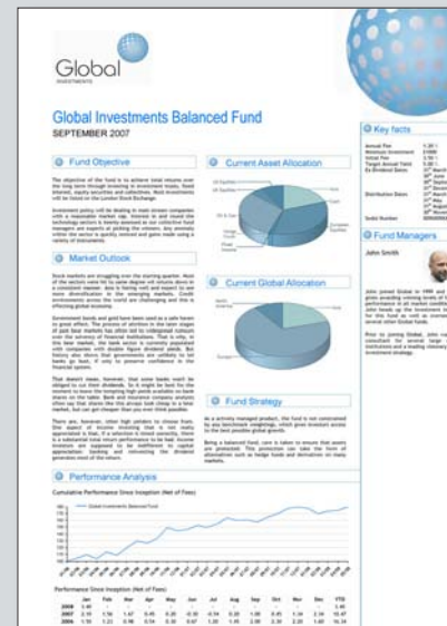
Sample fund fact sheets

All reports are stored and archived in an integrated document warehouse that can be accessed directly from SimCorp Dimension. The document warehouse offers full access to all historically generated reports.